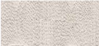
Dwight | 51HC