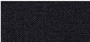
Shelby | 50HC