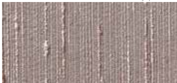
Conrad | 56HC