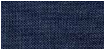
Waukon | 55HC