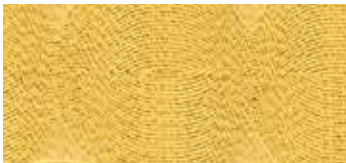
Essex | 54HC