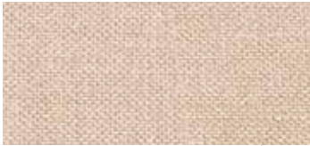
Coby | 57HC