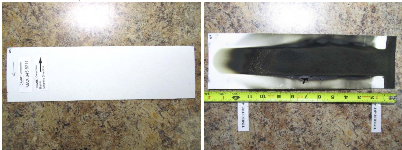
Typical Specimen (Back Side)