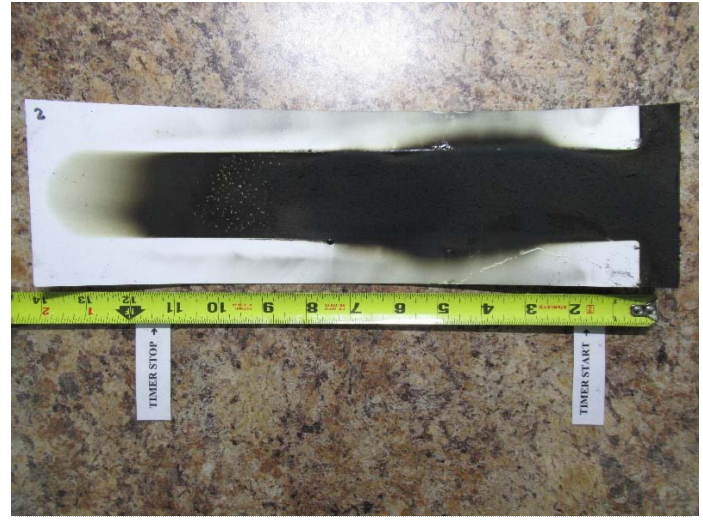
Sample 2 (Face Side/Exposed Side)