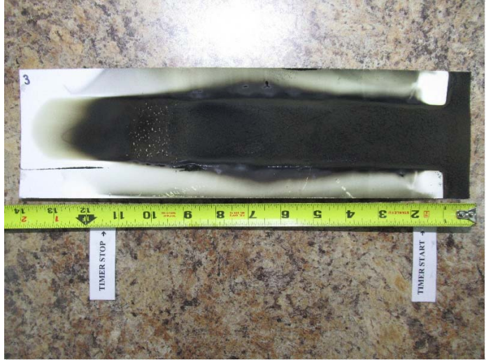
Sample 3 (Face Side/Exposed Side)