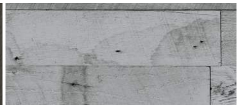
Patterns endless color options