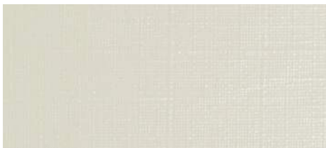
Linen Texture multiple color options