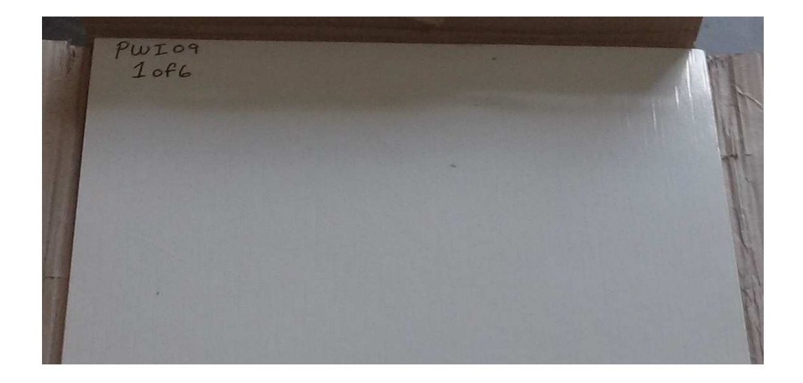
Photo 1. Unexposed Surface of Specimen Tested ***<<<END OF TEST REPORT>>>***